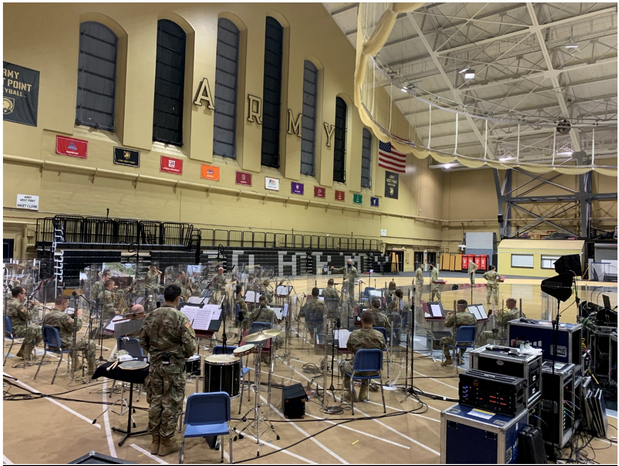
Large interior space, with individual mics and monitors